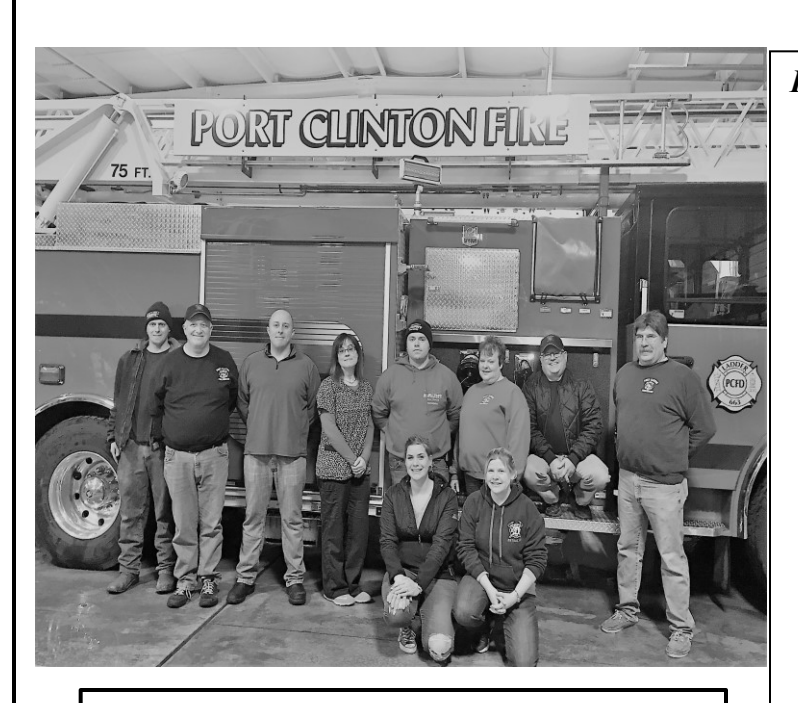
Portage Township Residents AND Port Clinton Firefighters/EMS