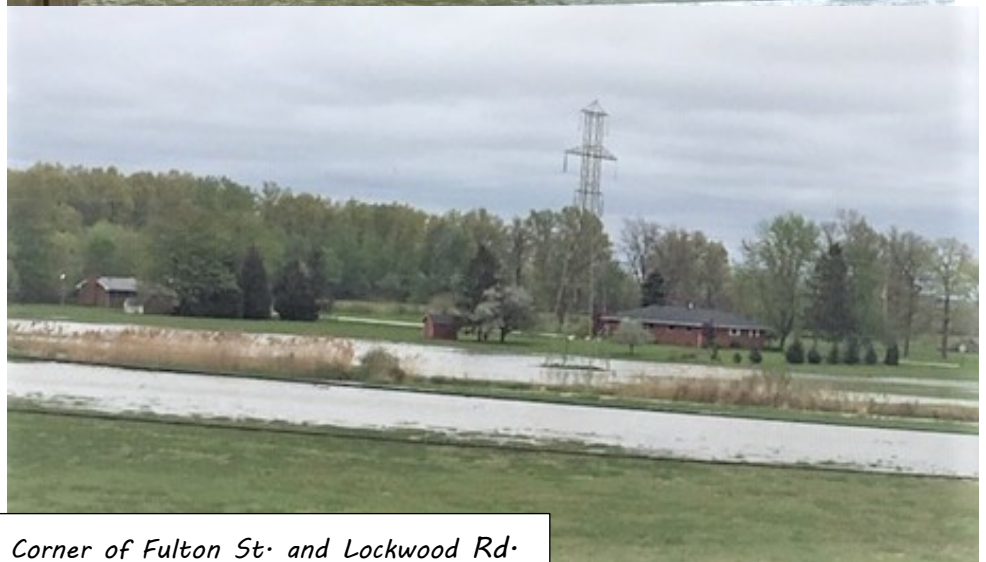
Corner of Fulton St. and Lockwood Rd.